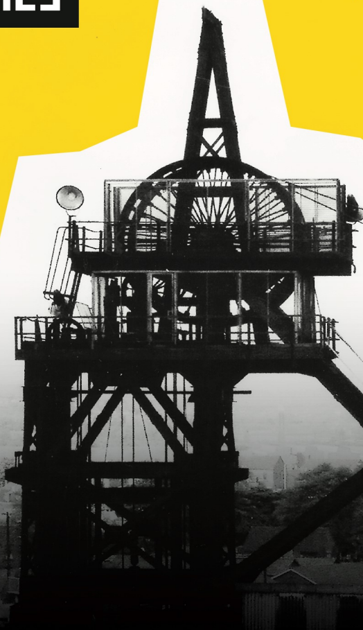
Silverdale 1982

A series of local events highlighting the stories of Silverdale Colliery and its Mining Community