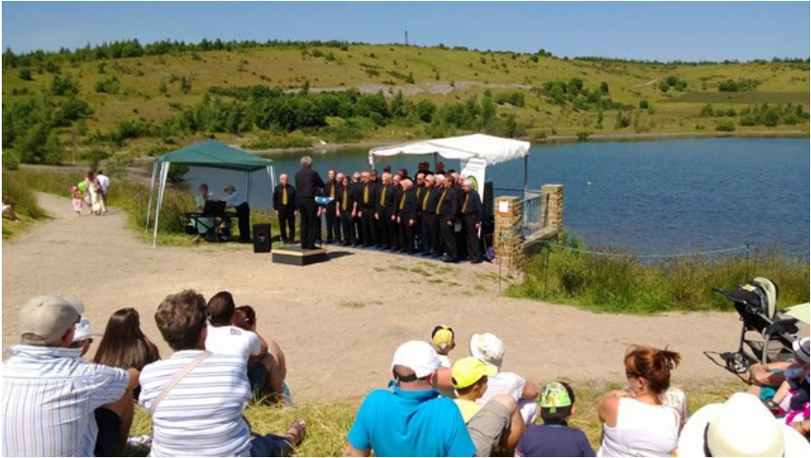
The Daleian Choir perform by the lakeside