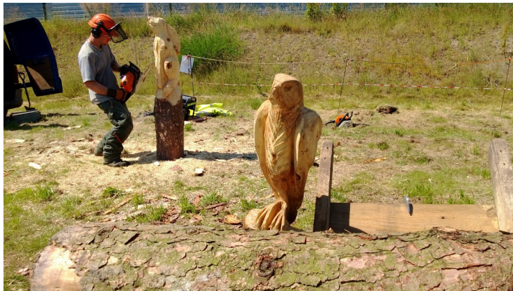
Fun Day –Chain-Saw Sculpture